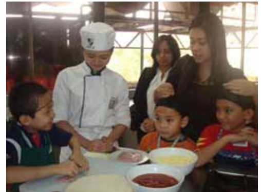
Maple kids enjoy their cooking experience at the Academy for International Culinary Arts.

For the fourth quarter, the class of 1-Oak is also off to explore their chosen countries and develop their creativity in a mini field trip as they learn about their new theme "Celebrating the World."