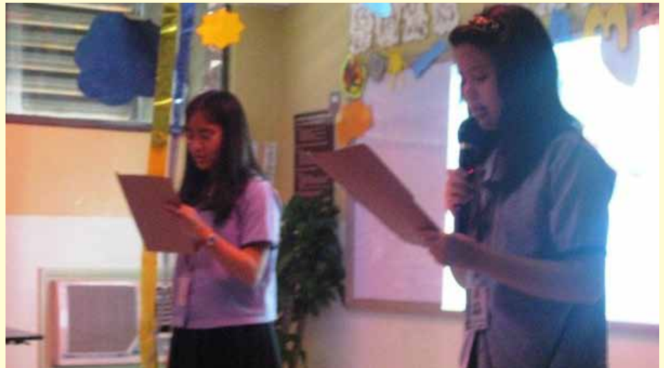
Girls from 6-Cedar shared their poems to the combined classes of Middle School 6 as their English PBA.

Middle School 6 and 7, on the other hand, had their classroom-based poetry reading sessions last December 10 and 11. Accompanied