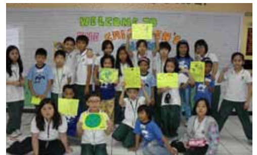
The class of 3-Pine present their pledges after discussing children's rights and responsibilities with the orphans from Tahanan ng Pagmamahal.